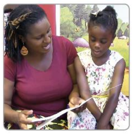
1. Help your child read the Sets 2 and 3 Speed Sounds

Your child will bring home a Book Bag Book. This book builds upon the ideas and many of the words in the Storybook he or she has read at school.